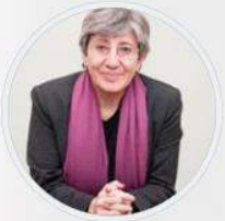
DR. SIMA SAMAR

A Way Forward: Strategies for Supporting Women in Afghanistan