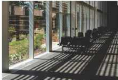
Photo: Surrey courthouse

The new Provincial Court Family Rules Wednesday, February 2 | 2:00 PM - 4:00 PM PDT This session will shed light on the changes to the Provincial Court Family Rules. The Surrey and Victoria Provincial Court Registries have put into place a pilot project for Early Dispute Resolution for Family Law cases. This webinar will talk about the pilot project and how it will affect people involved in a family law case.